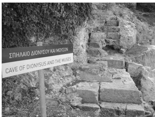
Fig. 3 : The staircase of the sanctuary of Dionysos.

The recent excavation focused on the investigation of the monumental staircase that constituted the southern border of the sanctuary of Dionysos and led to the cave and above (Fig. 3). The staircase was necessary because of the irregular and damp terrain. It is highly probable that the sanctuary was organized into terraces and the staircase provided access to them. It is 1.60 m. wide and was partially cut into the rock and partially built of stone masonry. The recent investigation revealed that its two ends are not preserved: the eastern lower part of the staircase had been destroyed