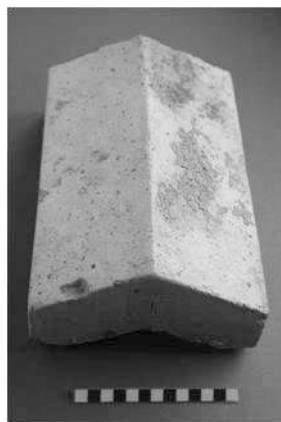
Fig. 11: Cover tile of the original roof of the temple of Zeus Ammon.