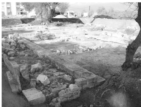
Fig. 12: One of the two parallel Roman buildings that accommodated the spectators in front of the temple of Zeus Ammon.

The recent investigation yielded a great number of finds including pottery, architectural members, fragments of marble statues and smaller finds, most of which are unstratified, since they were found in the trenches of the earlier excavation.