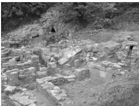
Fig. 1: The cave in the southern part of the sanctuary and the surrounding area, the fountain house and the fallen Roman cistern.

No temple of the god has been discovered in that area and the only structures of the shrine are a monumental staircase and the remains of a fountain house. It is assumed that Dionysos and the nymphs were worshipped in the cave – which was a common ritual practice in ancient Greece (Fig. 1). However, no cult evidence has been found inside the cave. 10 Only a few sherds, inscribed with the name of the god, were discovered in front of its entrance (Fig. 2).