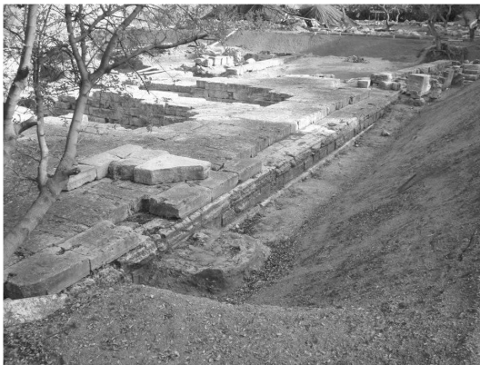
Fig. 6 : The temple of Zeus Ammon.

column shafts and capitals are the only remains of the pteron ( Fig. 7 ).