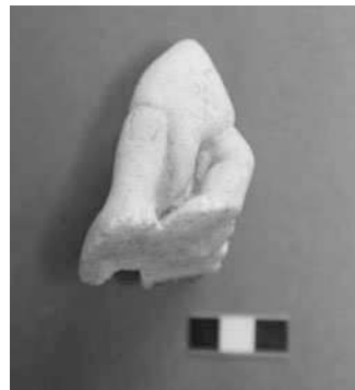
Fig. 24: Hand of Hygieia holding a snake.