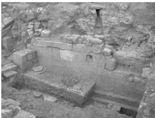
Fig. 4: The preserved part of the fountain house: water reached the fountain house through the underground built pipe on top of the spout.

Water from the area was used after the destruction and abandonment of the sanctuary in the 4 th century AD. Under the heavy deposits of lime formed by the presence of water, which had covered a great part of the area north of the staircase, a water-mill of the overshot type was discovered. 12 Its water wheel, in an oblong hole within the rock, was rotated by waterfalls ( Fig. 5 ). Its vertical and horizontal drums along with the millstones were accommodated within a small room found next to the wheel. This type of mill was known to