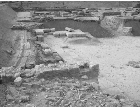
Fig. 18: The water channel that drained the water from the structure in front of the temple.