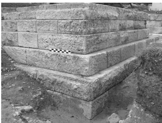
Fig. 7: Foundation – euthenteria – crepidoma – stylobate of the temple of Zeus Ammon.

The temple was destroyed towards the end of the 4 th century, probably by the earthquake which also destroyed Aphytis, or later, during the invasion of the Gauls. 15 It was immediately repaired; the entablature was replaced by a marble one and the original tiles of the roof by Hellenistic Corinthian of brown clay. 16 According to the data of the excavation of the 60s, another repair took place in the Roman Imperial period, probably in the 2 nd century AD. The tiles were again replaced by Laconian and the exterior underwent major changes. Two oblong parallel buildings were built in front of the temple to accommodate the spectators who watched the rituals that took place there. 17 Doric and Ionic architectural members are incorporated into the walls of these buildings, suggesting that various Classical or early Hellenistic edifices in the sanctuary had already been destroyed when they were built ( Fig. 12 ). The incorporation of Doric stone capitals from the temple implies that the pteron probably no longer existed in this period, which means there were major alterations to the temple's plan.