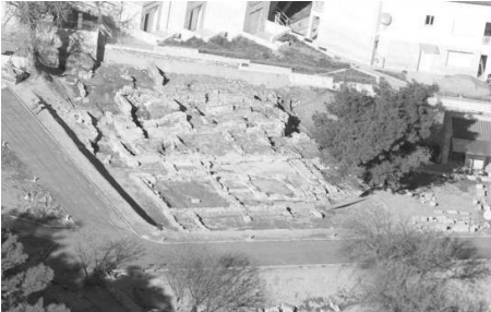
Fig. 20: The Roman balneum