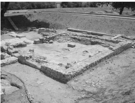
Fig. 23: The apodyterium : the northern area of the sanctuary, north of the temple of Zeus Ammon, where Asclepios was worshipped.