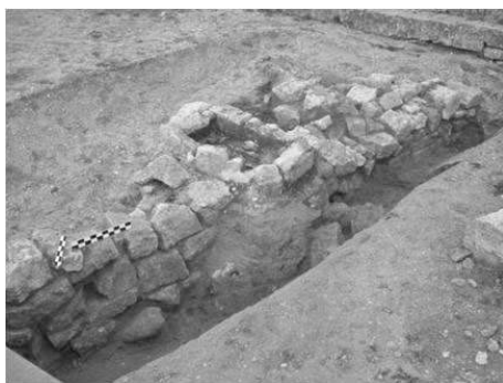
Fig. 13: The Roman altar in front of the temple of Zeus Ammon.