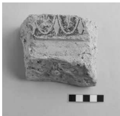
Fig. 9: Terracotta sima from the excavation of the temple of Zeus Ammon.