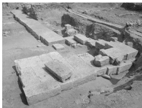
Fig. 16: The lowest course of stones of the high bases and other masonry blocks set on the rubble and stone floor.