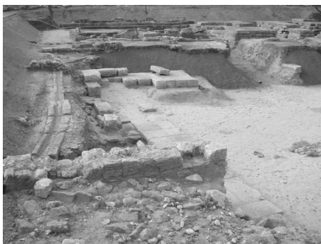
Fig. 17: The wall with gamma-shaped ends south of the bases.