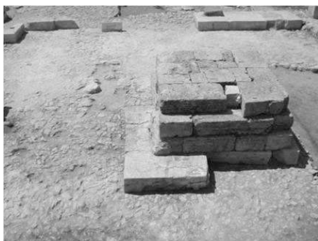
Fig. 15: A high base with its foundation on the floor of rubble and stone.