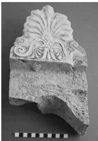
Fig. 8: Palmette antefix from the excavation of the temple of Zeus Ammon.

Furthermore, a small altar ( Fig. 13 ) of the Roman period was also found between the two parallel buildings, on top of an earlier wall, 18 and a basin – dexamene – dating to the 3 rd century AD was built at the northern part of the western wall. 19