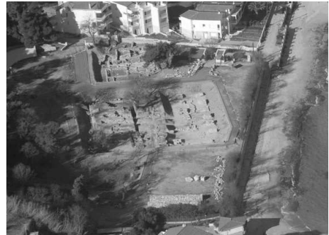
Fig. 19: The temple of Zeus Ammon and the open-air corridor flanked by two rows of monumental bases.