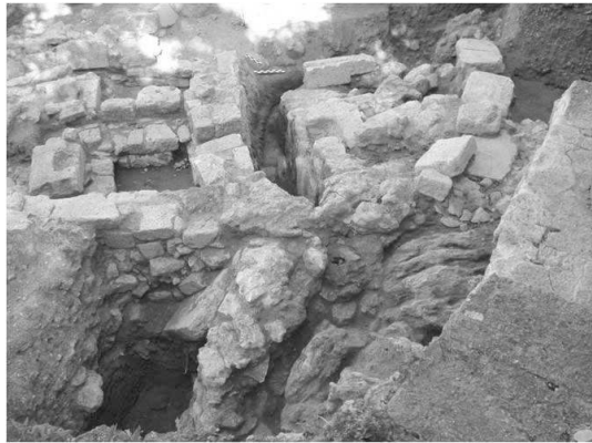
Fig. 5 : The water mill.

The temple was discovered and excavated in the late 60s. 13 Originally, it was a peristyle temple with 6 columns on its narrow and 11 on its long side. It consisted of a pronaos and a cella. Its dimensions (10.51 × 21.43 m.) recall those of the temple of Asclepios at Epidaurus ( Fig. 6 ). Today only six rows of ashlar masonry – the foundation, euthenteria and crepidoma – and a small part of the stylobate are preserved, while a few Doric