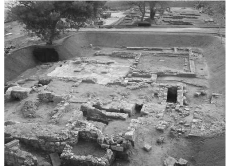
Fig. 21: The frigidarium: the central area, the apodyterium and the pool.