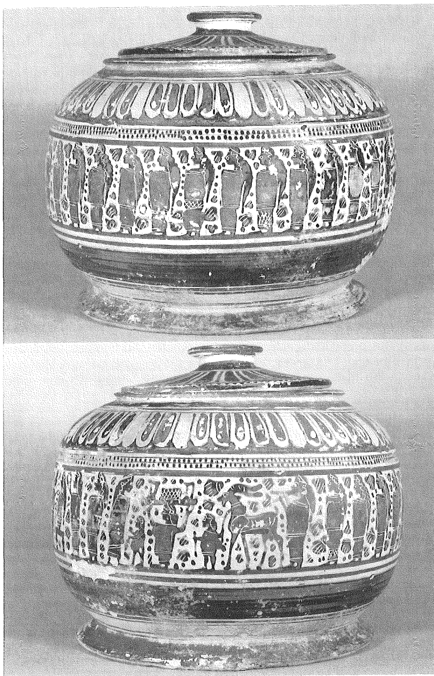
Figs. 7 & 8